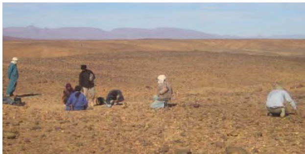
Figure 3- Nomads collecting debris of the Martian meteorite of Tissint (Tata Morocco).

In fact this fall took place in the heart of a usual prospection area of the Arabic nomads living in the military zone between Morocco and Algeria, which have some knowledge of meteorites and are looking for meteorites for the whole year on their wandering through the desert (figure 3). In several weeks of a deep search the nomads collected about 12 kg of fragments of the meteorite, some of them not passing 1 gram.