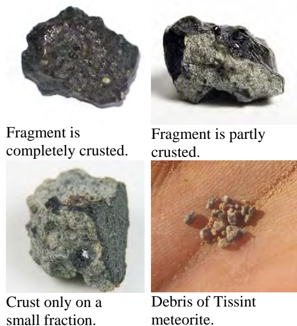
Fragment is completely crusted.

Historically, watched falls took place only once in 50 years or more (1815 in France, 1865 in India, 1911 in Egypt and 1962 in Nigeria). This is once in the career of a human being. The nomads of the region of Tissint (a region in the east of Morocco, situated 60 km to the south-east of the town of Tata nearby the Moroccan-Algerian border) became to know that the pieces of rocks collected nearby their camp of the beginning of January 2012 had been in fact Martian meteorites. They started a search for the other pieces of the same fall and indeed other pieces were found in a long drawn-out zone of about 15 km in length. Most fragments have a small size, which is explained by the explosive nature of the bolide. Most fragments were found to have a well developed crust. 16 of the 51 fragments are completely crusted, 11 are partly crusted and 24 fragments have crusts only on a small fraction of the surface area (figure 1). In the sands of Oued El Myit and Oued Bou Ifasouan the men and women of the nomads used sieves in order to find debris if not even dust of this extraterrestrial rock.